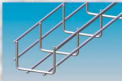
Open standard cable trays

- Comes with the following wire cable tray types