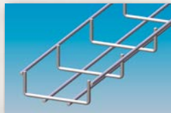
Open compact trays