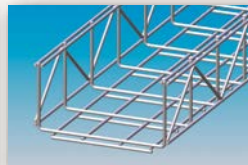
Heavy duty cable trays