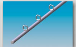
Cable trays for one cable

In addition, we offer a large number of specialty trays and a comprehensive program of assembly parts, mounts and accessories.