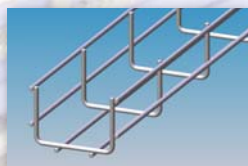
Open standard cable trays

- Comes with the following wire cable tray types