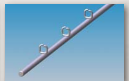
Cable trays for one cable

In addition, we offer a large number of specialty trays and a comprehensive program of assembly parts, mounts and accessories.