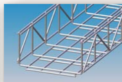
Heavy duty cable trays