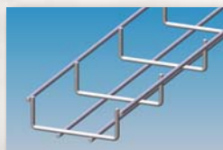
Open compact trays